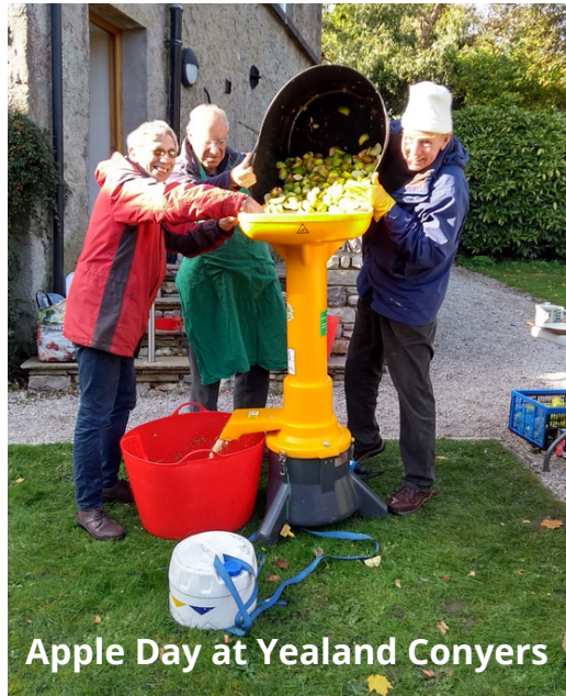
Apple Day at Yealand Conyers

Lots of stalls - art, crafts, books, plants and more - plus cafe, live music and Santa!